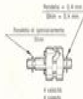
Fig. 28 Carter con carter