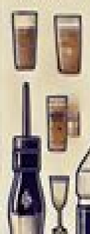
200ml Half-pint 730ml