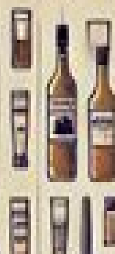
Mini Half-pint 500ml