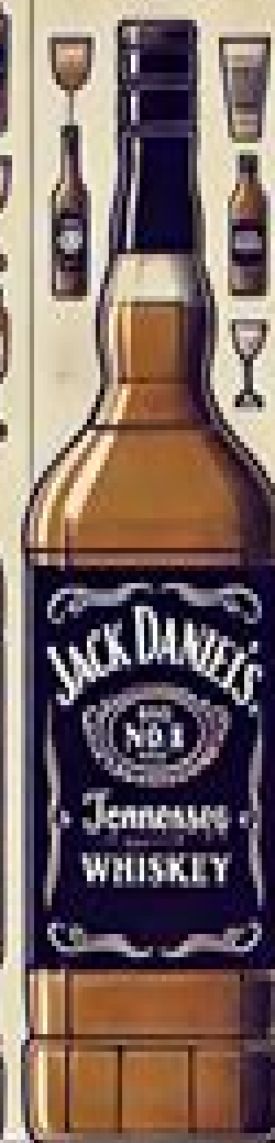
JEROBOAM Common uses