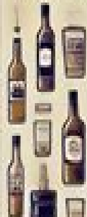
5ini Half-pint 200ml