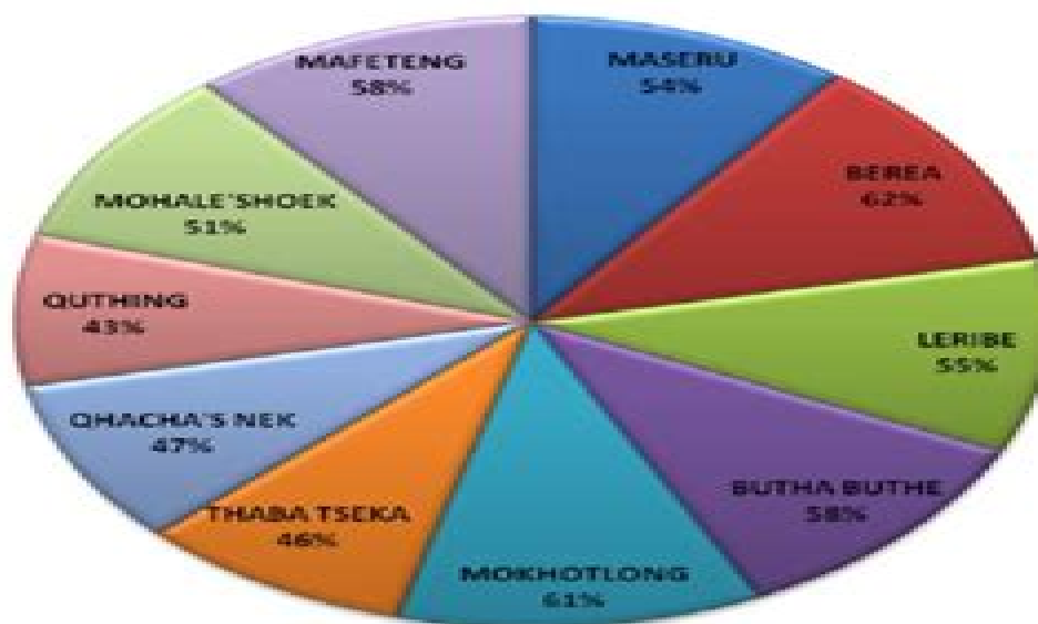
2012 PERCENTAGE PASSES BY DISTRICTS JANUARY 2013