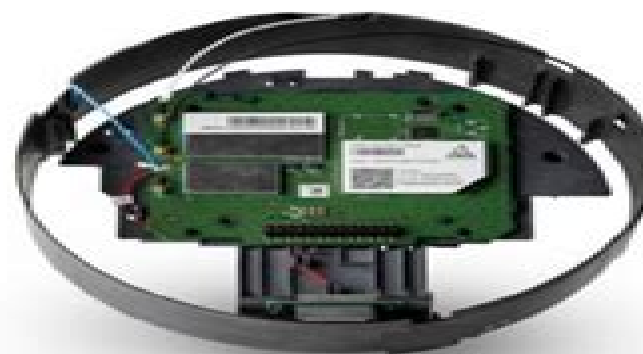
AOS Edge Server Router for Aclara kV2c Meters

With its integrated IEEE 802.15.4 radio subsystem, the AOS ESR-M can serve as a Border Router, Router Node, or End Node in a Wi-SUN IPv6 mesh field area network. In addition, its IEEE 802.11 WLAN radio subsystem allows the AOS ESR-M to serve as a WLAN hotspot, enabling local secure communications with utility field tools and end customer devices, appliances, and vehicles.