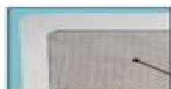
Cloth Backed Micro-Perforated Grill