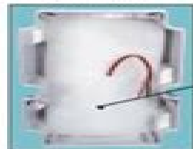
Polyfill Damped Rear Enclosure