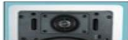
Tuned Ported Enclosure