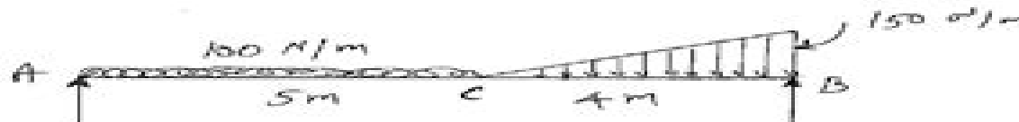
12. a (i)