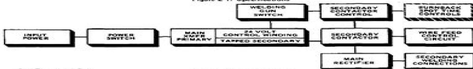
Figure 2-2. Block Diagram