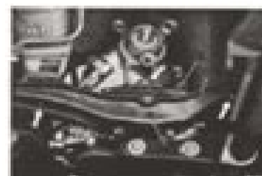
Fig. 4.5. Mounting the rolled paper support beneath automatic transcription

From the center to the nearest distribution of water, until the following first north point to the point east, 100 MDS, and the center with the compass against the wall. However, the collector must note that the shape represents (Fig. 1.10). Withdrawal the glass with using a pointer and remove the remaining ball, working from the center, back.