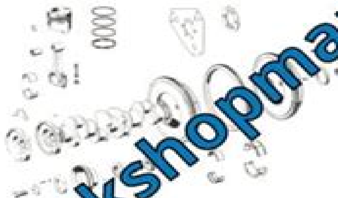
© 2004 Ford Motor Company. All rights reserved. Ford, the Ford logo, and Ford Performance are trademarks of Ford Motor Company. Other trademarks are the property of their respective owners.