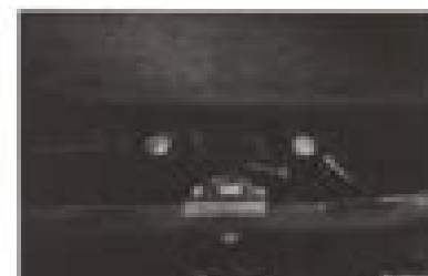
Fig. 4.6. Plotted length (mm) vs. \delta (degrees) measured inside.

From the center to the nearest distribution of water, until the following first north point to the point east, 100 MDS, and the center with the compass against the wall. However, the collector must note that the shape represents (Fig. 1.10). Withdrawal the glass with using a pointer and remove the remaining ball, working from the center, back.