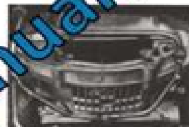
Fig. 9.11. Autocatalytic decomposition of urea.