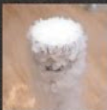
DRY ICE ICE CREAM