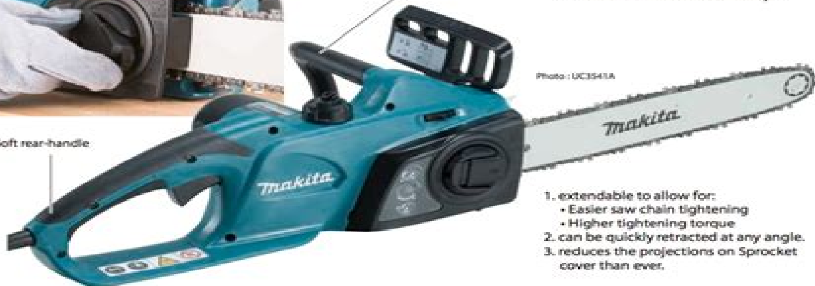
Easy-to-grip Front loop handle

The whole shape is firmly held, especially when the machine is tilted sideways.