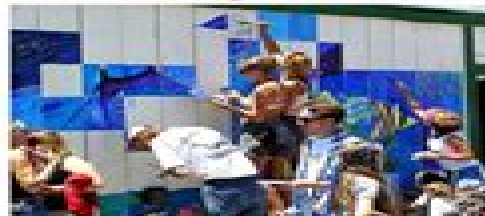
Students gathered to paint the gym wall