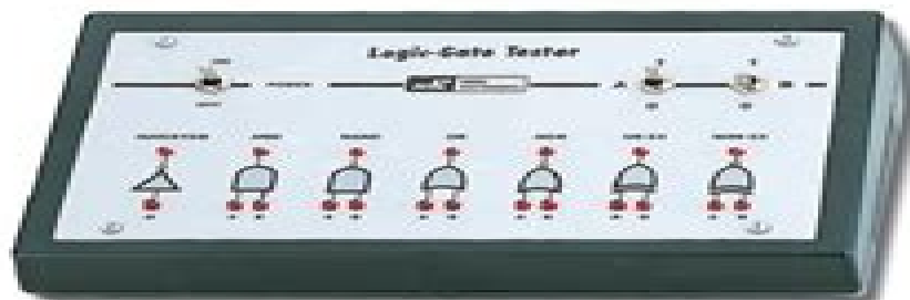
Figure 602 : Vous vous rendrez vite compte de l'utilité de cette table de vérité électronique, car elle vous permettra de savoir instantanément quel niveau logique sera présent sur la sortie d'une porte, simplement en modifiant les niveaux logiques sur les entrées.

port, car il n'est pas rare qu'une broche sorte à l'extérieur ou bien qu'elle se replie vers l'intérieur. En utilisant de petits morceaux de fil gainé, soudez les broches des inverseurs S1, S2 et S3 sur les pistes du circuit imprimé, comme indiqué sur la figure 598.