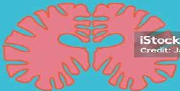
Severe Alzheimer's stage