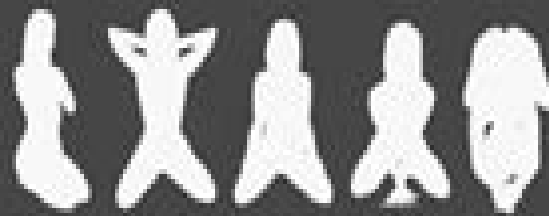
Arms Up, Clasp Arms, Feet, Hands To Floor, Hands