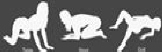
Feet, Feet, Feet