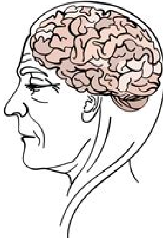
MALADIE D'ALZHEIMER LÉGÈRE