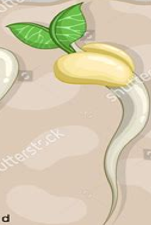
4 day old