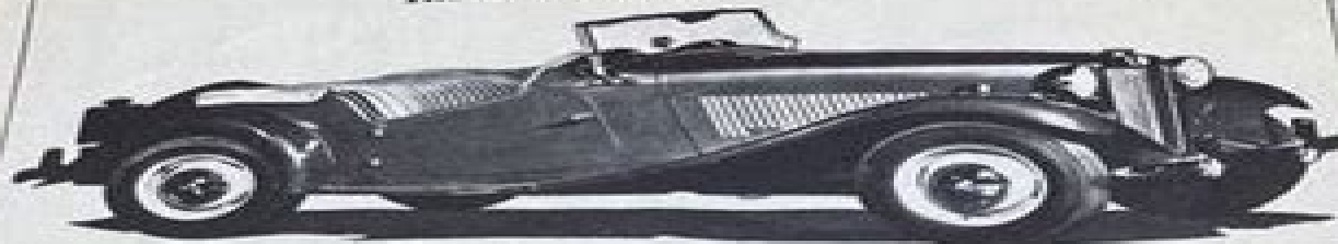
THE M.G. MIDGET (Series "TF")

Copyright 1954 by M.G. Car Company, Ltd.