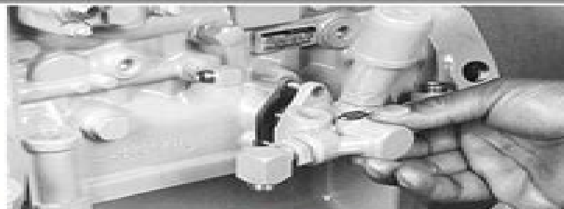
Removing Fuel Supply Pump