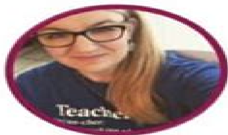
Tales Of A Fourth Grade Educator