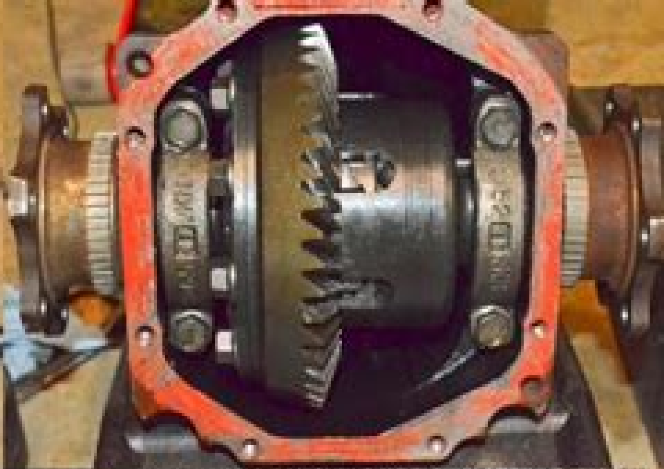
This one is out of an Auto 350Z/G35 and has the 3.357:1 Gear Ratio. It has a Cusco RS LSD in it. Note the Ring gear is thicker and the mounting surface on the Diff. is off to the left compared to that of the one that came out of a Manual 6 Speed.