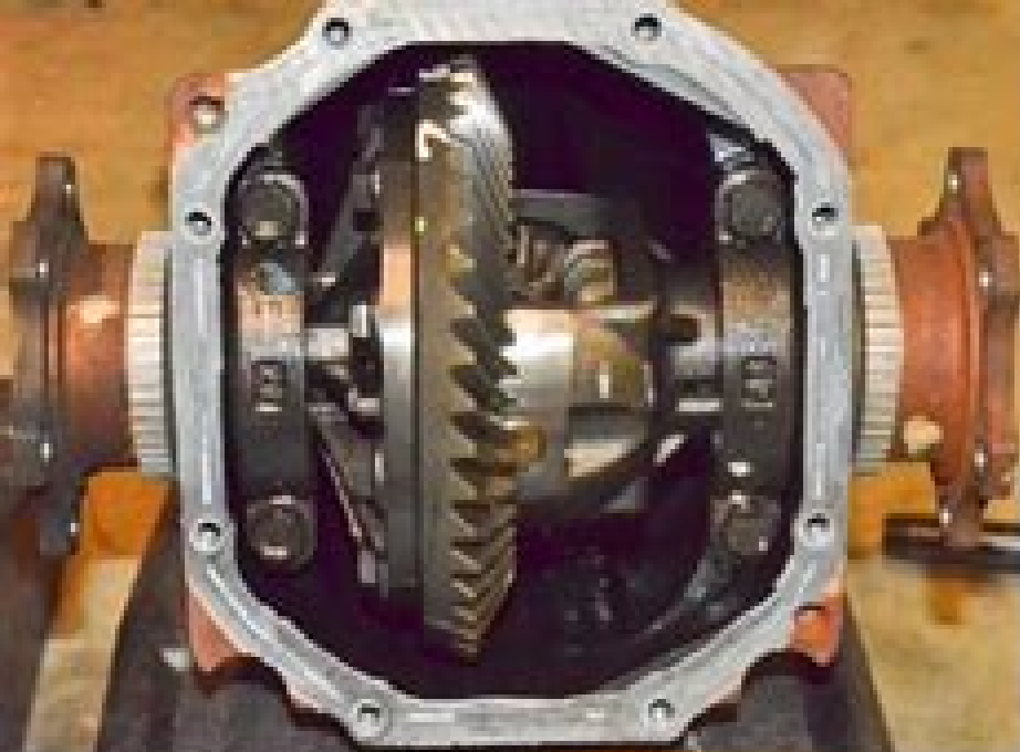
'07 350Z Base 6 Speed with the Open Diff, and 3.538:1 Gear Ratio