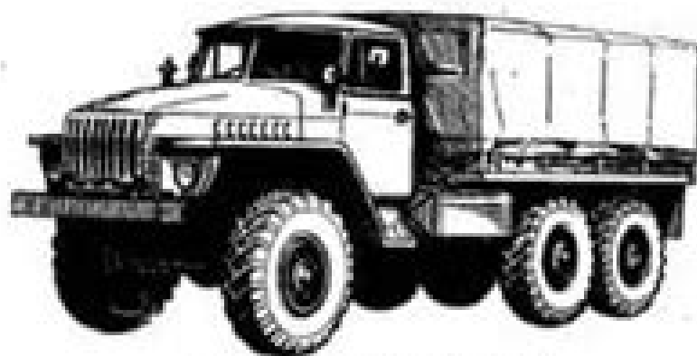
Рис. 1.4. Автомобиль-тягач Урал-4320

имеются ведущий и поворачивающий, в привод и них применены шаровые равные угловые скорости, обеспечивающие равномерную передачу крутящего момента даже при значительном угле поворота колес. Для повышения способности автомобиля преодолевать особо трудные участки местности, обеспечивая самовыскаживание и вытеснение других машин при их застревании в конструкции автомобиля Урал-4320 предусмотрена лебедка, привод в которой осуществляется от коробки передач через коробку отбора мощности.