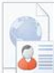
Contacts Web Database