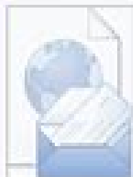
Charitable Contributions Web Database