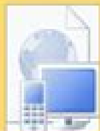
Assets Web Database