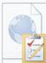
Issues Web Database