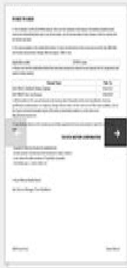
2010 Toyota Prius Repair Manual.pdf