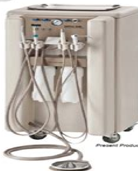
Present Production Model Shown

8000-001 8000-002 8000-003 8000-004 8000-005 8000-006 8000-006S 8000-007 8000-007S 8000-008 8000-008S