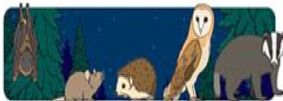
Bats mice hedgehogs owls badgers

Carry out your own research project into nocturnal animals and be ready to present your ideas to the class! You could find out about: