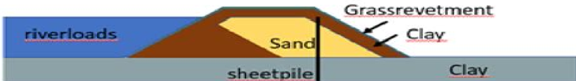
c) Ductile dike with sheetpile