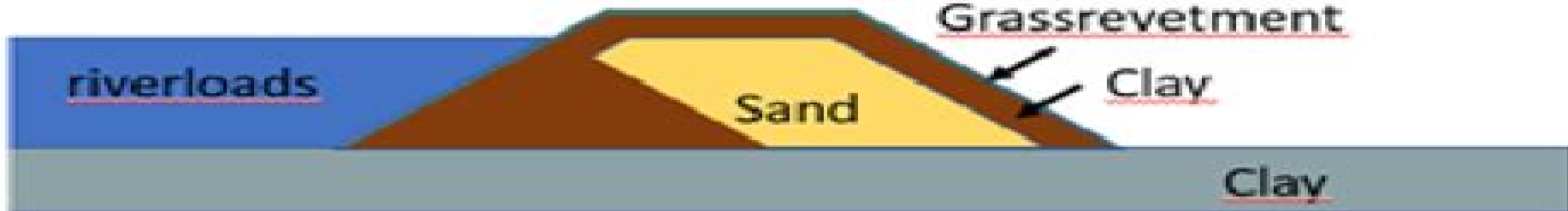
a) Present dutch dike