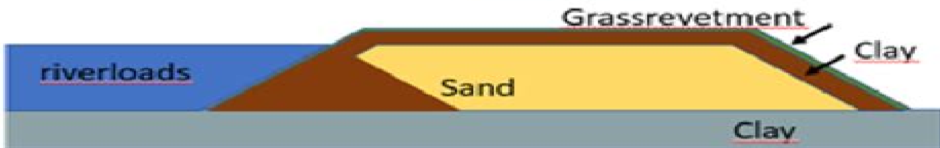
b) Delta dike