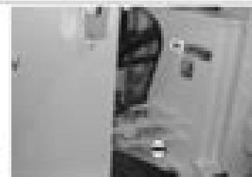
Page | History | Topics | Feedback

Estimated daily effect depending on species composition and on above ground forest biomass