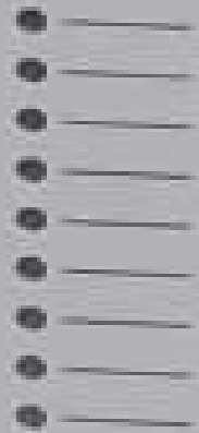
ABB Power Line Protection REC 545