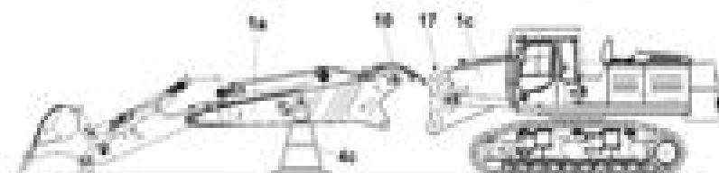
Fig. 3-114 Removal of the earthmoving attachment - phase 2