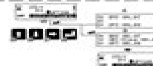
Fig. 3: Hydraulic system schematic diagram of the hydraulic system