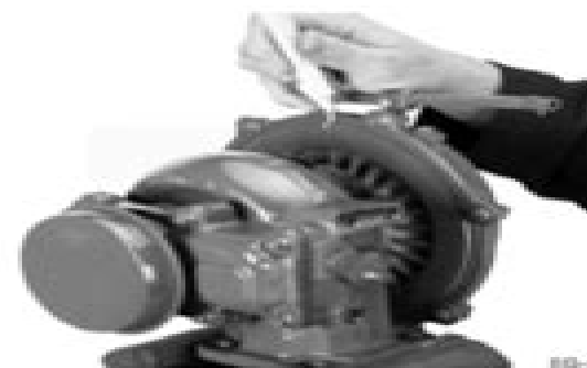
Figure 2.10 Mark Compressor/Backplate Location