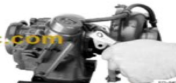
Figure 2.11 Remove Hose Clamp