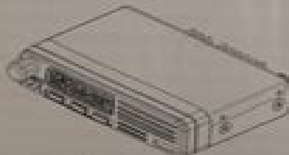
4 channel version

YAESU MUSEN CO., LTD. 1-20-2 Shimomurocho, Ota-Po, Tokyo 145-8545, Japan