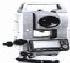
Gbr1. Tampilan SOKKIA Set 510