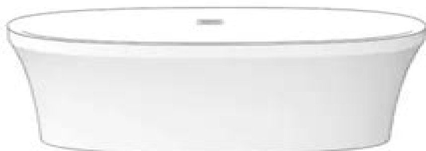
LIBRA AURORA 6634