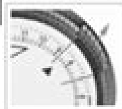
Fig. 27. Indstilling af tændingstidspunkter