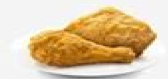
2 PIECE ORIGINAL CHICKEN