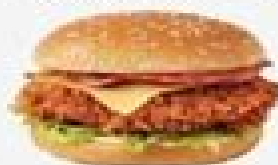
FILLET BACON DELUXE BURGER