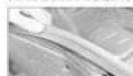
2-23: Radiator and fan assembly

2-6: Radiator and fan assembly 2-7: Radiator and fan assembly 2-8: Radiator and fan assembly 2-9: Radiator and fan assembly 2-10: Radiator and fan assembly 2-11: Radiator and fan assembly 2-12: Radiator and fan assembly 2-13: Radiator and fan assembly 2-14: Radiator and fan assembly 2-15: Radiator and fan assembly 2-16: Radiator and fan assembly 2-17: Radiator and fan assembly 2-18: Radiator and fan assembly 2-19: Radiator and fan assembly 2-20: Radiator and fan assembly 2-21: Radiator and fan assembly 2-22: Radiator and fan assembly