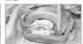
2-25: Radiator and fan assembly