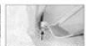
2-28: Radiator and fan assembly