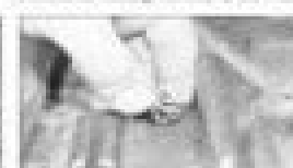
2-24: Radiator and fan assembly