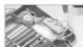
2-26: Radiator and fan assembly