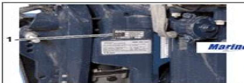
1. Model and serial number

Model and serial numbers are located on the swivel bracket and on the powerhead.