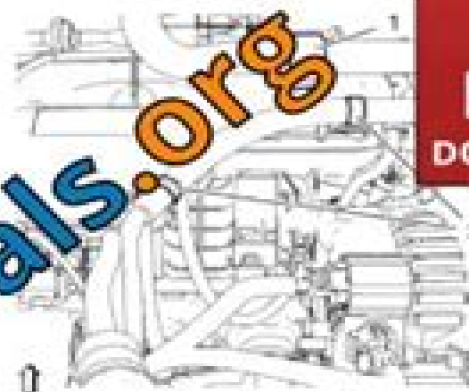
Fig. 8. Engine Block Assembly Components