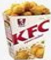
REGULAR POPCORN CHICKEN