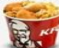
10 PIECE BARGAIN BUCKET