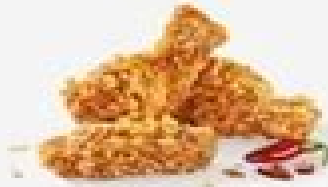
3 HOT WINGS