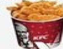
14 PIECE BARGAIN BUCKET