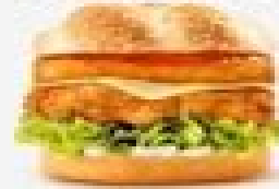
ZINGER TOWER BURGER