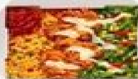
ORIGINAL RECIPE RICEBOX