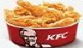
MIGHTY BUCKET FOR ONE