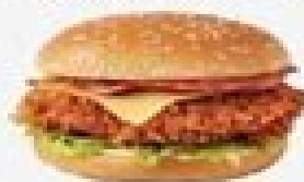
FILLET BACON DELUXE BURGER