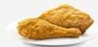
2 PIECE ORIGINAL CHICKEN