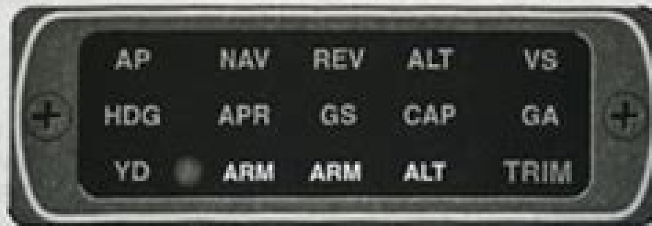
FIGURE 1-3 KA 285A REMOTE MODE ANNUNCIATOR

The FCC interfaces to the remote mode annunciator via a serial data bus (clock, data, and strobe). This annunciator displays all Flight Director modes, as well as AP, YD and TRIM FAIL.