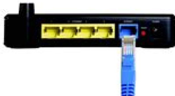
Figure 4-5: Connecting Another Router