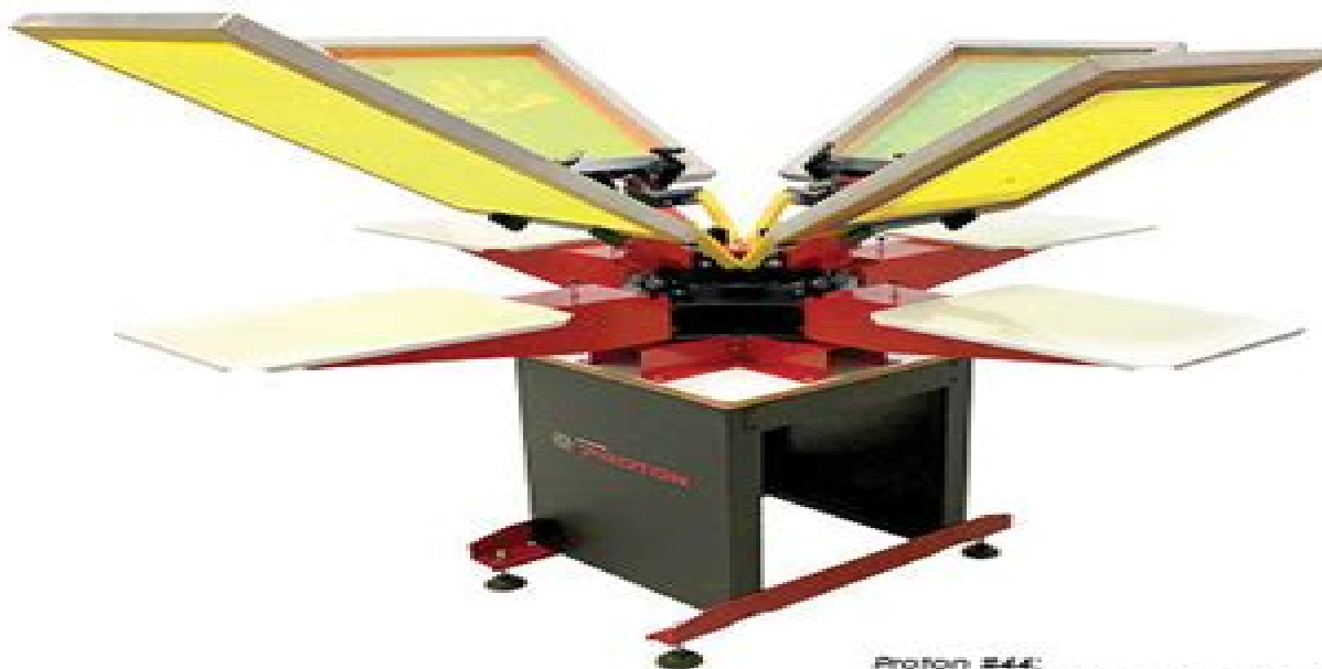
Proton 244: 4-Color, 4-Station, with optional floor stand