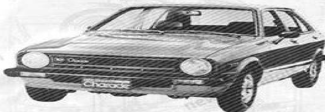
Fig. 1 Front View of Daihatsu CHARADE XG