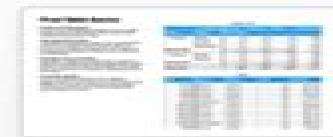
Aspectos básicos de las tablas dinámicas