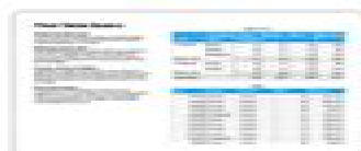
Aspectos básicos de las tablas dinámicas