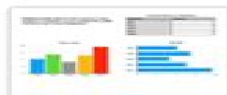
Aspectos básicos de las gráficas