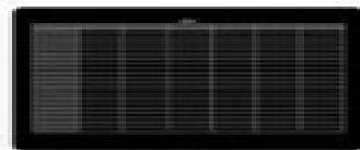
Negra en blanco