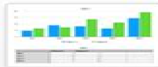
Tabla y gráfica