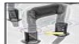
Automated ITH solder joint inspection with live CAD data overlay and Flashi Filters™ image optimization