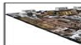
3D Computed Tomogra- phy of a USB flash drive