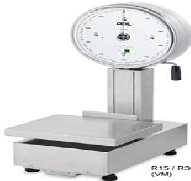
R15 / R30 (VM)