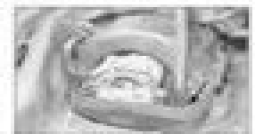
2-25: Radiator and fan assembly