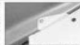
2-7: Radiator and fan assembly