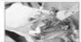
2-8: Radiator and fan assembly

2-6: Radiator and fan assembly 2-7: Radiator and fan assembly 2-8: Radiator and fan assembly 2-9: Radiator and fan assembly 2-10: Radiator and fan assembly 2-11: Radiator and fan assembly 2-12: Radiator and fan assembly 2-13: Radiator and fan assembly 2-14: Radiator and fan assembly 2-15: Radiator and fan assembly 2-16: Radiator and fan assembly 2-17: Radiator and fan assembly 2-18: Radiator and fan assembly 2-19: Radiator and fan assembly 2-20: Radiator and fan assembly 2-21: Radiator and fan assembly 2-22: Radiator and fan assembly