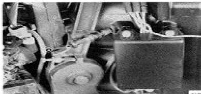
a - Maximum Spark Advance Screw