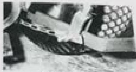
Fig. 4 — Check Chain